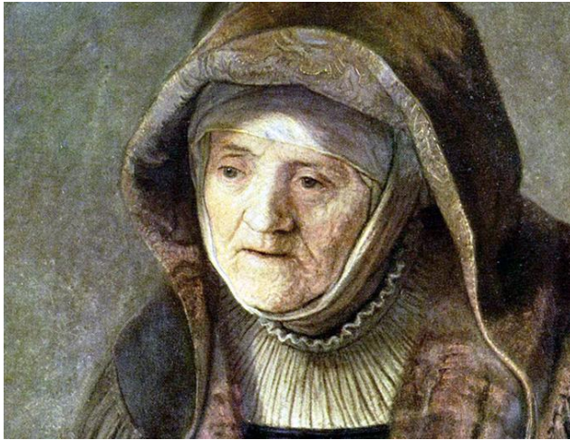
Rembrandt, "The Prophetess Anna," 1639

Grace Lutheran Church 40 N. Main St., Hatfield, PA 19440 Gracelutheranhatfield.org