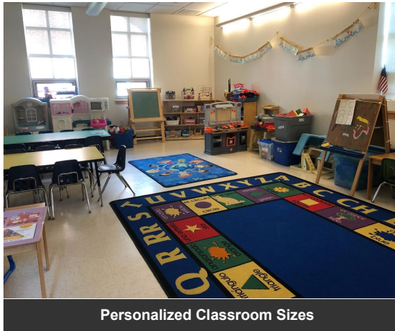
Personalized Classroom Sizes