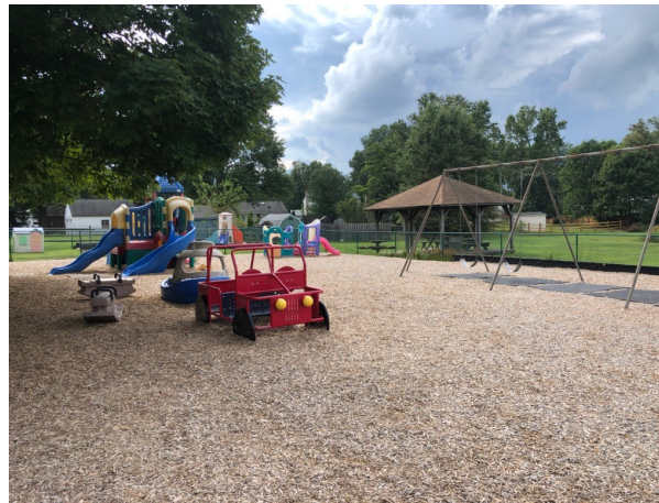
Large Playgrounds for Toddlers through Kindergarten

Stepping Stones prides itself on providing high quality child care at affordable prices. Contact our Director today to hear about our variety of pricing options and what discounts you may qualify for!