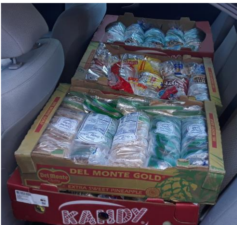
Sandwich-making Instructions on page 2