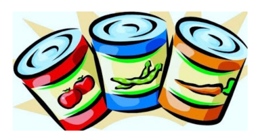
See More Important Details Inside

Sept 29 Congregation Transitional Workshop